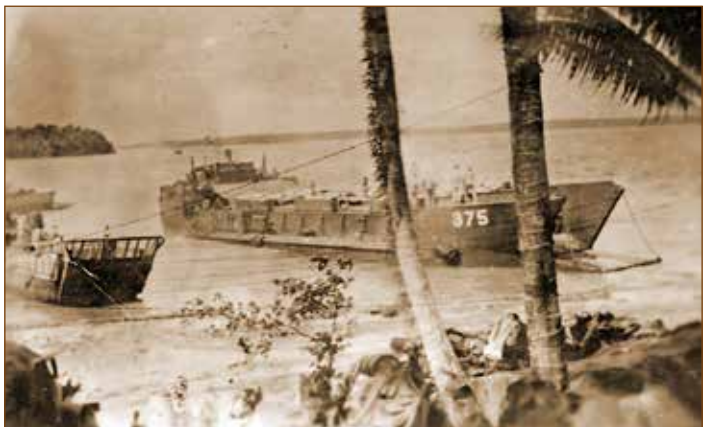
US Navy Landing Craft are pictured at Liana Beach, New Georgia, Solomon Islands in September 1943.