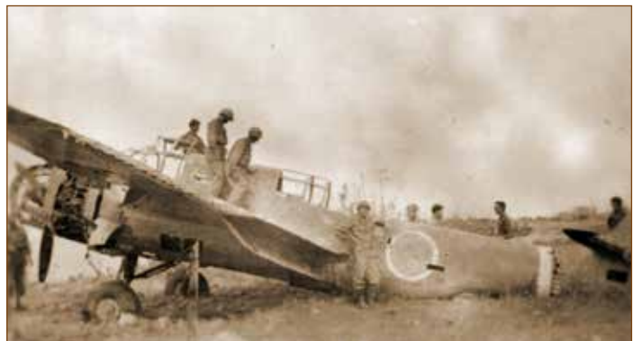
Crashed Japanese bomber at Munda, New Georgia, July 1943.