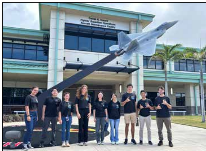
At the Hawaii Air National Guard's Daniel K. Inouye Fighter Squadron Operations Aircraft Maintenance Facility.

This past year has been about far more than just flying milestones—it's been a journey filled with new learning experiences and profound growth. Our Pathfinders have received support and personal mentorship from a variety of pilots—young and old. They toured the amazing Hawaii Air Traffic Control Facility and saw first-hand operations in the Honolulu tower. In addition, they visited the Hawaii Air National Guard where they saw the launch of F-22 Raptor life support operations from the airfield. Students also received multiple tours of a privately-owned executive business jet, piloted by