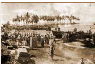
Cape Torokina, Bougainville, Nov. 1943.