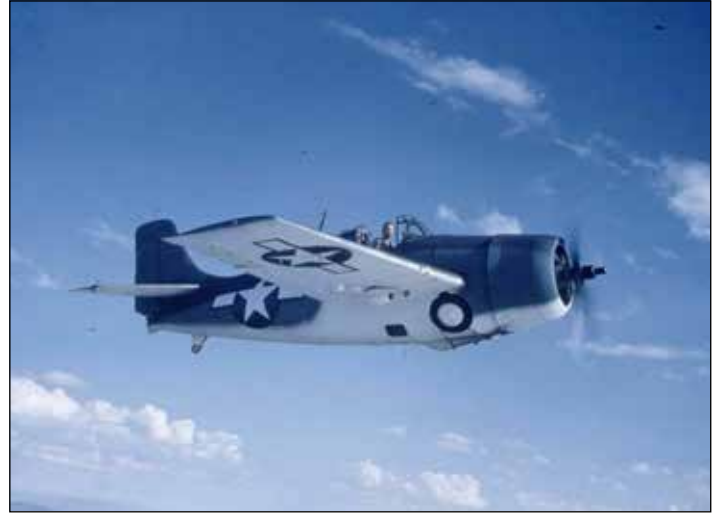
F4F Wildcat soars over the Pacific Ocean during WWII.

Undeterred, and with considerable Navy interest, Grumman would work feverishly to redesign the XF4F-2, and emerge with the XF4F-3. Equipped with a Pratt & Whitney “Twin Wasp” SC2-G (XR-1830-76/86), an increased wing span, squared wing tips, and various other modifications, the XF4F-3 was awarded a