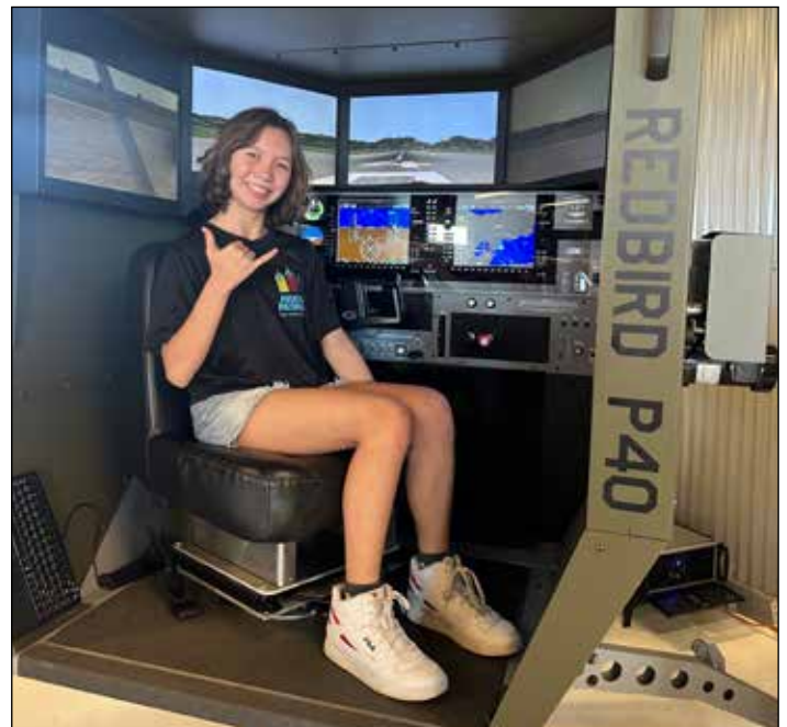
Training in a Flight Simulator in the Museum's Aviation Learning Center.

After completing my first solo flight in December 2023, I began preparing for my check-ride. I turned 17 in August, which meant I was finally eligible for a Private Pilot License. I'm thrilled to announce that on August 27, 2024, I officially earned my PPL! My aviation journey started with a dream, and my passion for flight has fueled my commitment to building a career in this industry.