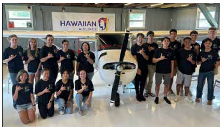
The first Aviation Pathways cohort at the Museum's ALC.

Leading this first Aviation Pathways cohort has been both fulfilling and exciting and I am eager to continue this work with our next cohort of Pathfinders this fall. Although I can't say when, where, or how these young men and women will do it, I am certain that they will, someday, be in key leadership positions in the aviation industry in Hawaii.