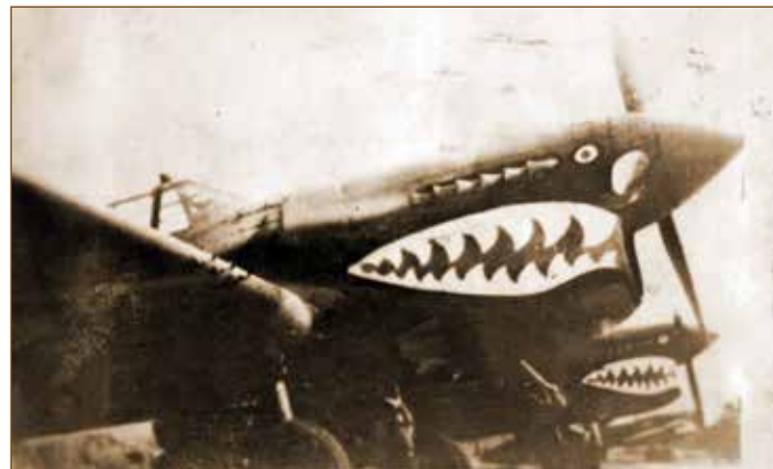
P-40 Fighters in famous Flying Tigers paint scheme on flight line at Munda, New Georgia, Solomon Islands in July, 1943.