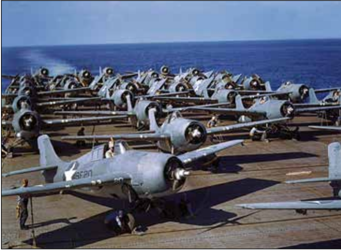
F4F Wildcats on the flight deck of USS Ranger in autumn 1942.