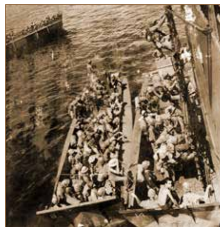
Landing at Cape Torokina, Bougainville.