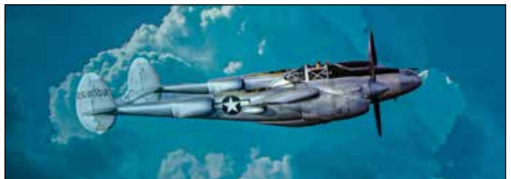
P-38 Lightning patrols the Pacific Theater during WWII.