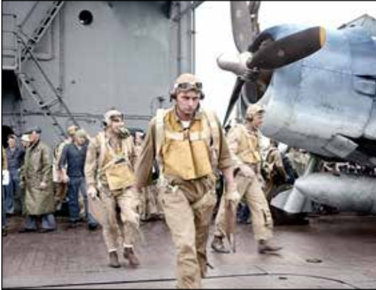
Pilots walk toward Hellcats on USS Saratoga.

World War II Aircraft Carrier Pacific Theater Color Photographs from the National Archives