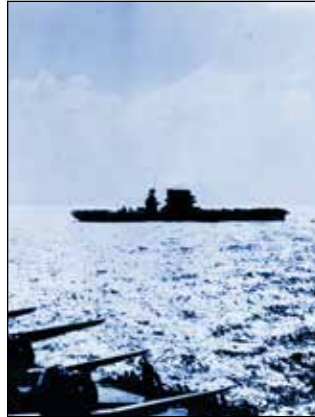
USS Lexington at Coral Sea.