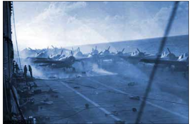
Flight Deck of USS Lexington as smoke rises from fires on May 8, 1942.