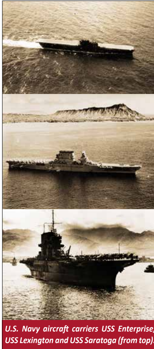
U.S. Navy aircraft carriers USS Enterprise , USS Lexington and USS Saratoga (from top).

On November 28, 1941, the Enterprise left 1010 Dock at Pearl Harbor and moved down the channel to an open and uncertain sea. Days later, Task Force 12 led by the Lexington , departed on December 5, 1941 and headed for Midway Island to deliver much needed air support.