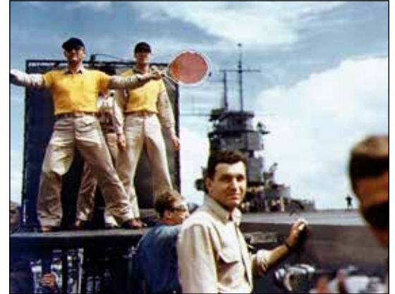
Top Navy ace David McCampbell, brings in planes.