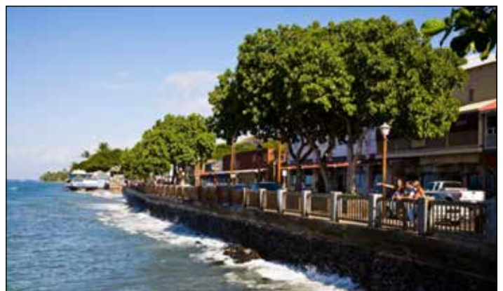
Historic Front Street in Lahaina, Maui before the fire.

Mahalo for your gracious support, preserving the legacies that are foundational to our lives.