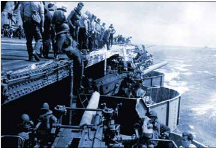
Damage to the USS Lexington during Battle of the Coral Sea.