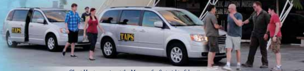
Ghost Hunters arrive at the Museum for first night of shooting.

Yes, they did record evidence of paranormal activity, but those of us who work here already knew that! The episode aired in a one-hour special on June 1st on the SyFy channel. You can also watch full episodes on hulu.com. Stay tuned, there is more to come!